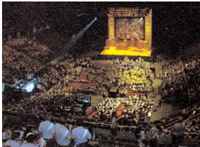
One of the many NOAC 2004 shows held.