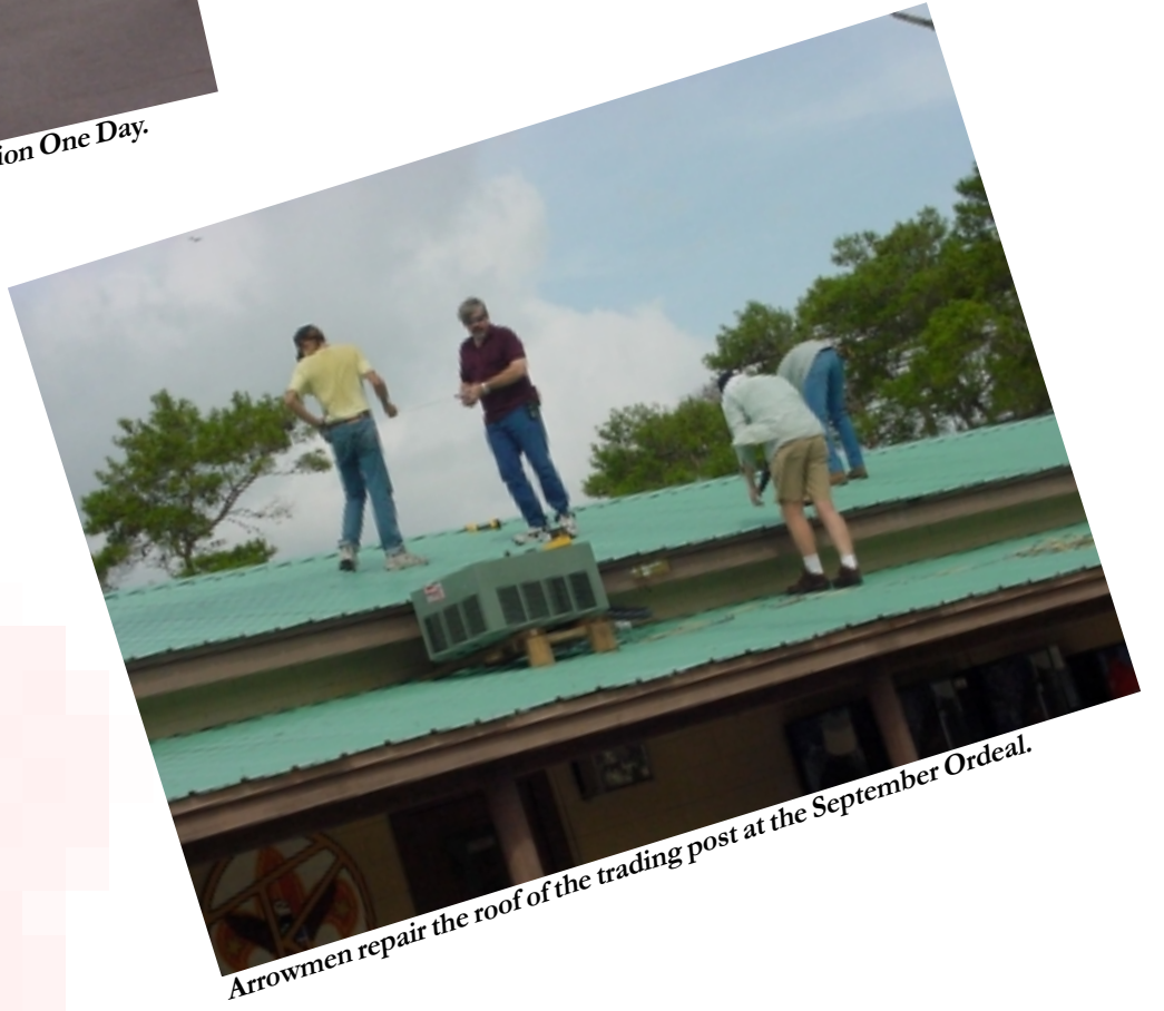
Arrowmen repair the roof of the trading post at the September Ordeal.