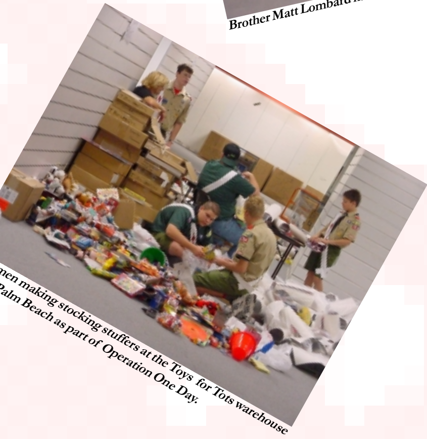
men making stocking stuffers at the Toys for Tots warehouse in Palm Beach as part of Operation One Day.