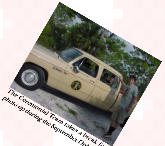
The Ceremonial Team takes a break for a photo op during the September Ordeal