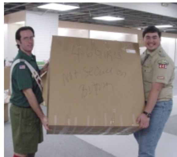
Our fearless leaders.....