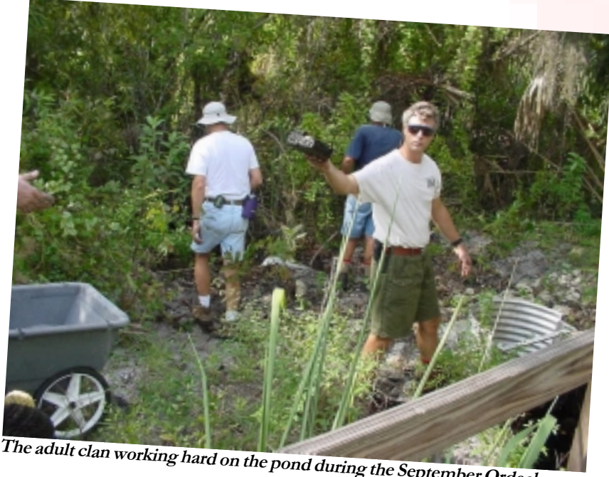
The adult clan working hard on the pond during the September Ordeal.