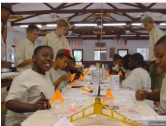
Young scouts learn how to build and launch rockets as a part of the Operation First Class schedule.