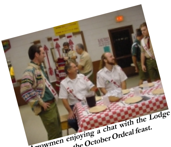
Arrowmen enjoying a chat with the Lodge Chief during the October Ordeal feast.