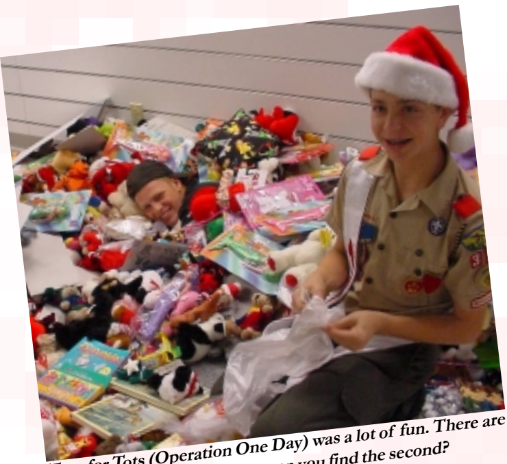
Toys for Tots (Operation One Day) was a lot of fun. There are two Arrowmen in this photo, can you find the second?