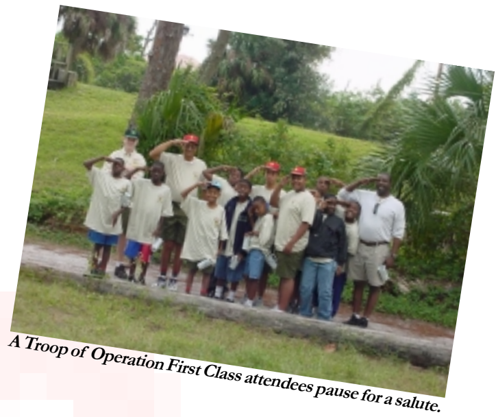
A Troop of Operation First Class attendees pause for a salute.