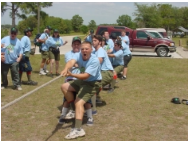
The youth of Aal-Pa-Tah pulled their way to the top...