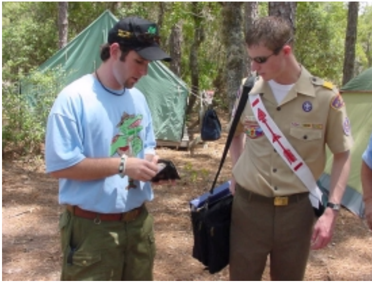
...for a fee that is. No wait, they are just exchanging business cards