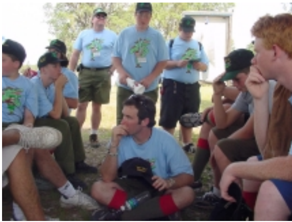
Some of the crew huddles around the lodge chief for a mid-day break during the competitions