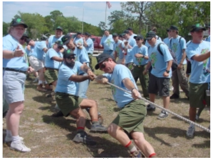
...while the adults of Aal-Pa-Tah tugged their way to victory