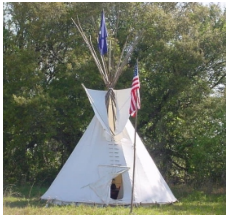
When you become the 237 Lodge Advisor or the Section Associate Advisor, you too get to sleep in a tipi at Section Conference