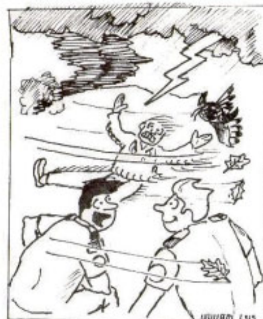
"They really work on special effects for their ceremonies!"