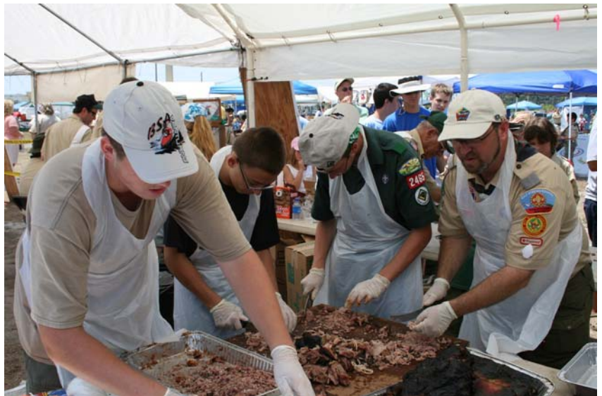
Pig (Above), Turkeys (Below)

Mega Show Pig Roast/Turkey Fry Adult Advisor