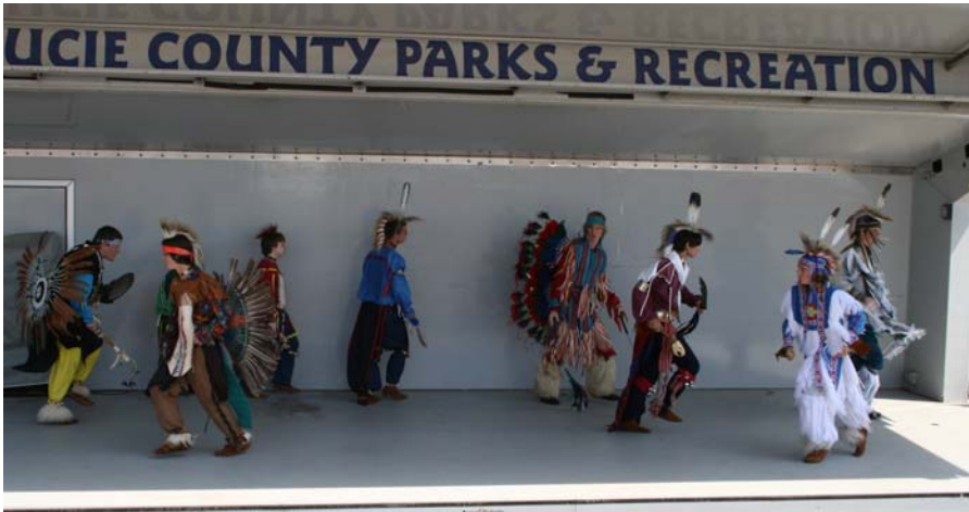
The Hitchiti Dancers!