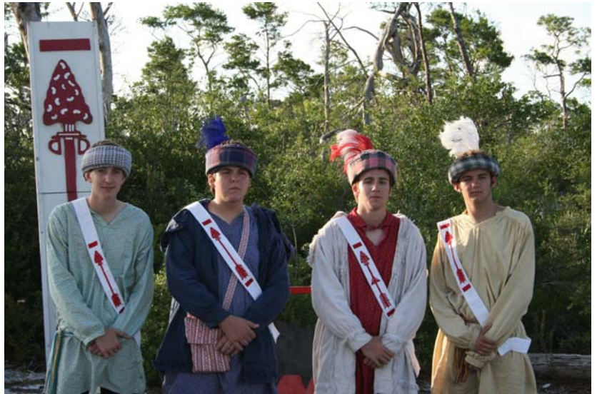
The Ceremonies Team Poses for a Picture