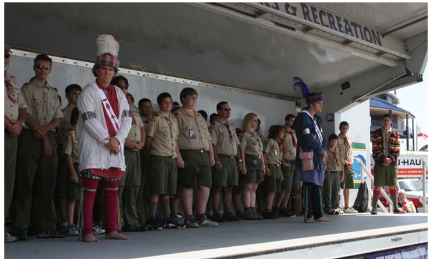
Visit www.aal-pa-tah.org for more pictures, many more pictures