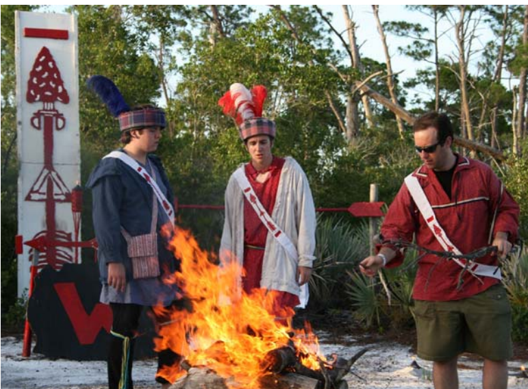
The Ceremonial Team prepares for the Ordeal Ceremony