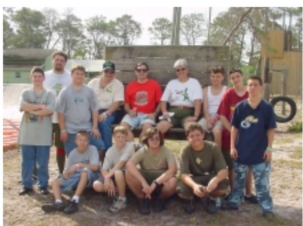
The A-Bani-KI Chapter takes a break for a photo-op between morning competitions at the Spring Powwow.