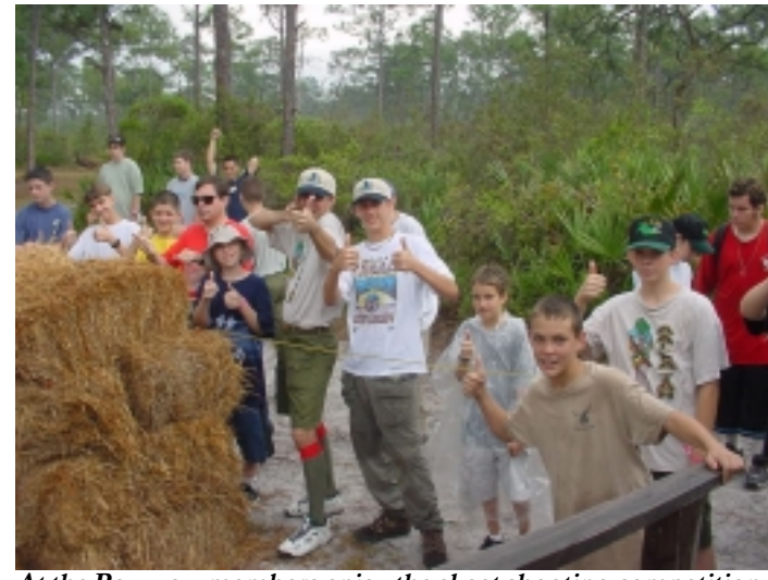
At the Powwow members enjoy the skeet shooting competition.