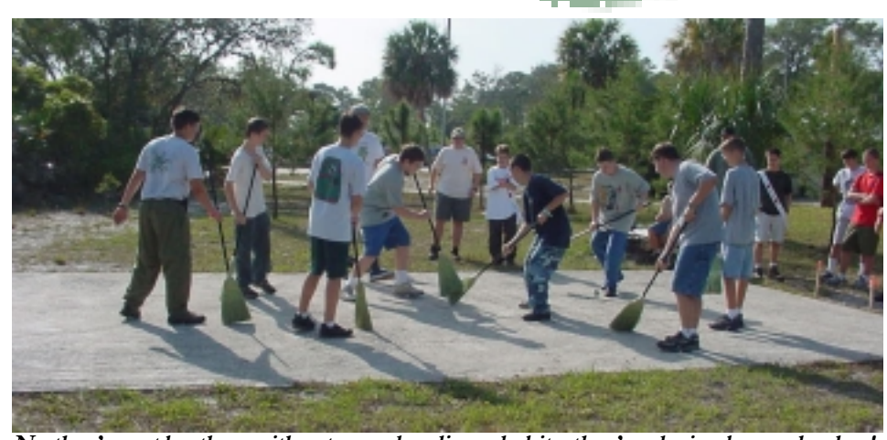
No, they're not brothers with extremecleanliness habits, they're playing broom hockey!