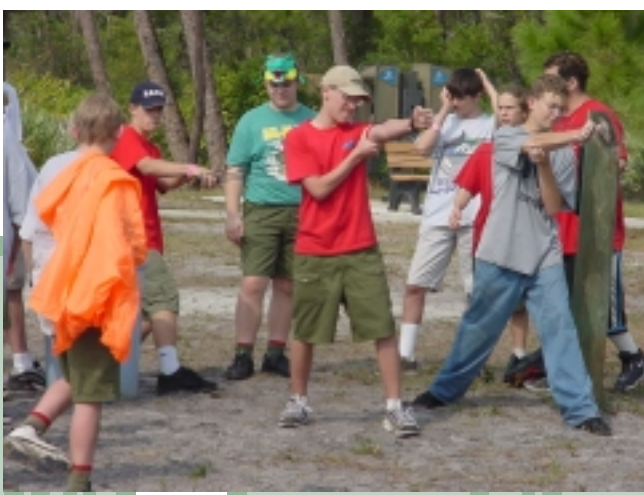
The Lowaneu Mawats watch as the Ne-Ke-Wa Chapter takes their winger shots during the Quest for the Golden Arrow.