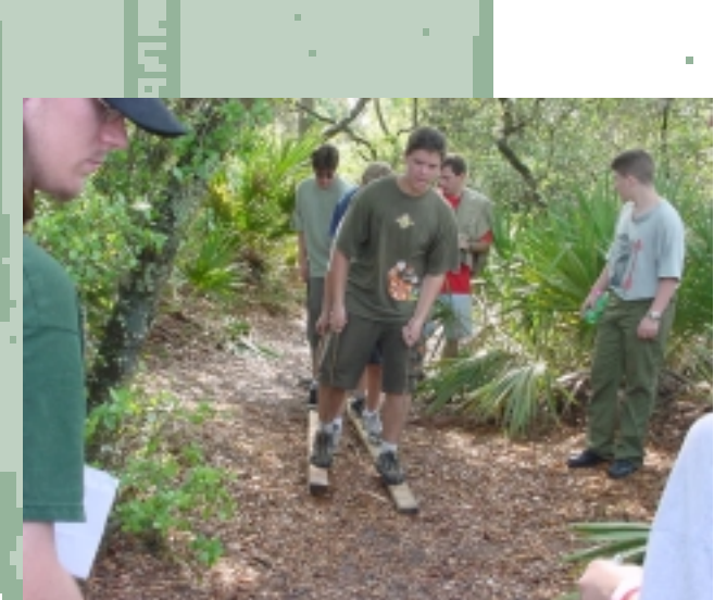
The Sand-Ski portion of the Quest was mighty..uh...feirce.