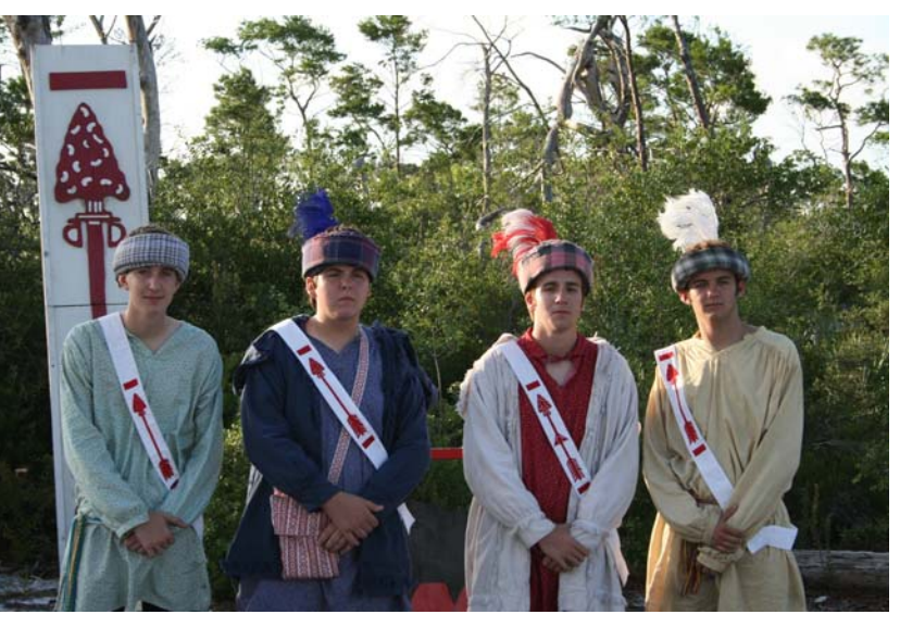
The Ceremonies Team Poses for a Picture

This weekend included Service to Tanah Keeta an Ordeal Ceremony and a healthy dose of fun. We had 56 new members inducted into our Order, we hope you come back to our next Ordeal Weekend on September 5^{\text{th}} — 7^{\text{th}} which will include a good deal of fun for our new members.