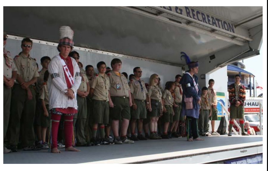
Visit www.aal-pa-tah.org for more pictures, many more pictures