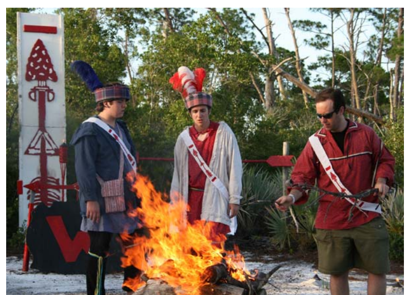
The Ceremonial Team prepares for the Ordeal Ceremony