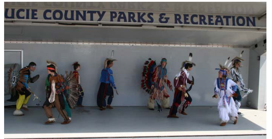
The Hitchiti Dancers!