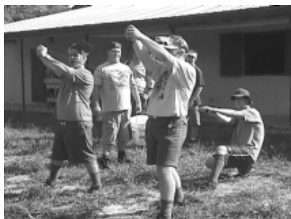
The team from the Lowaneu Mawat Chapter takes aim during the Winger shoot competition