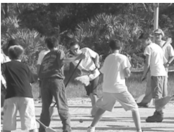
The chapter broom-hockey competition once again made an appearance at the Fall Fellowship