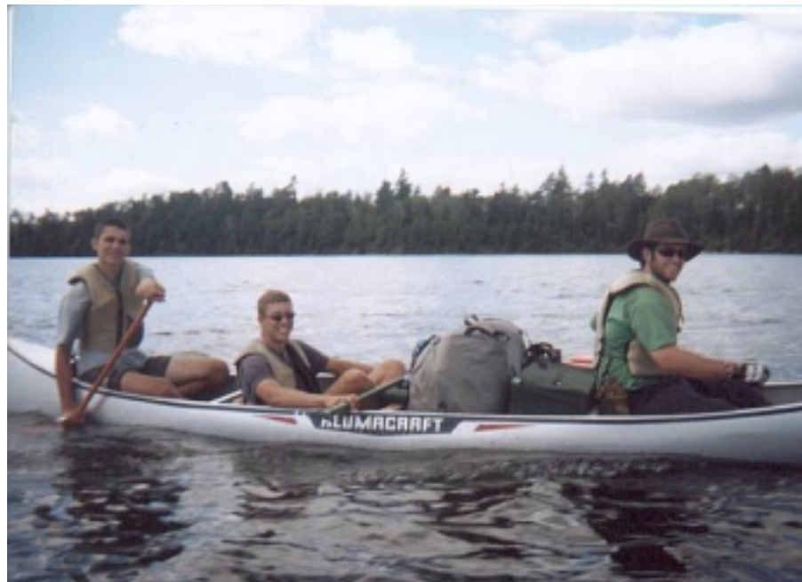
OA Voyage has lots of fellowship and great sites to offer.... and oh yeah...lots of p