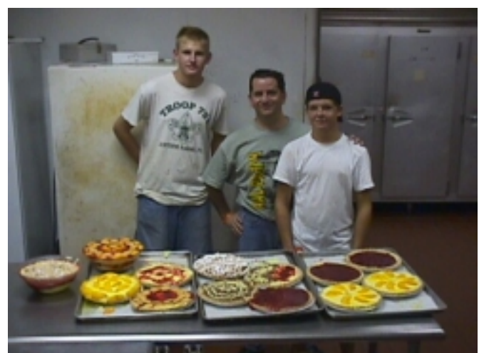
Our kitchen staff went above and behind this weekend, amongst the excellent food of the weekend were these pies which they made from scratch. Thanks again guys