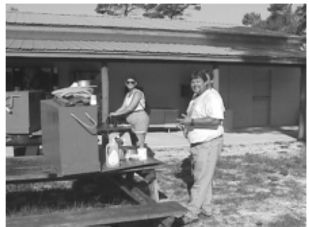
Even though it was a fun weekend on the schedule, some Brothers still took some time to give service to camp. Thank you to all who helped out