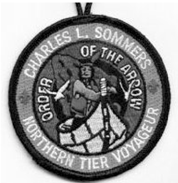
The rare OA Northern Tier Voyageur Patch. Each participant only gets one.