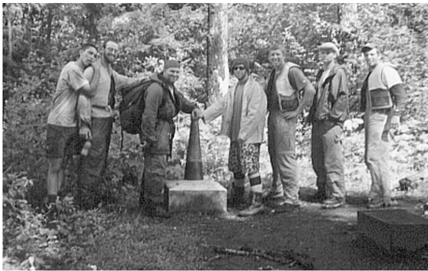
OA Voyage Crew OAV807B at the historic Height of Land. This spot marks the halfway point of their 140-mile roundtrip; Canada is behind them, USA is in the foreground. Crew 807B broke the record making the trip in 4 days!