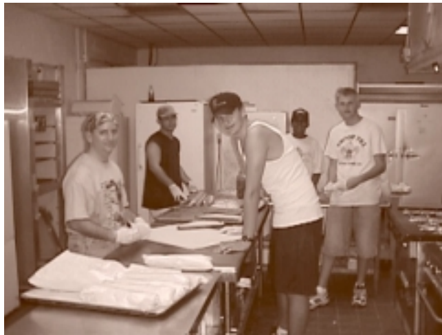
The hardworking kitchen crew provided some fabulous food at the Fall Fellowship. Hats off to the chefs