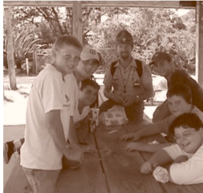
Brother's take a quick photo break between activities at the F