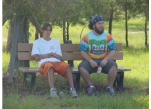
Some Brothers resting and watching the Ultimate Frisbee competition at the Fall Fellowship