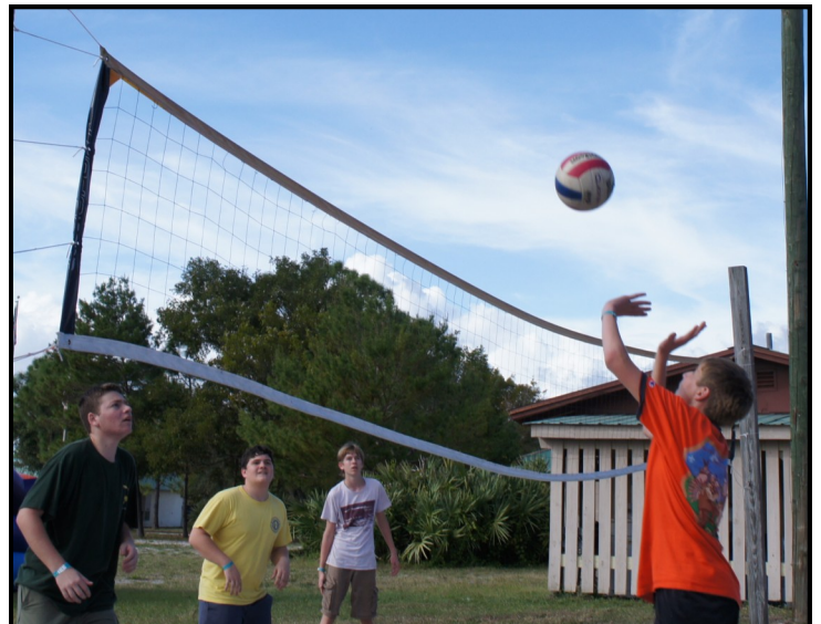
Volleyball Competition in Full Swing